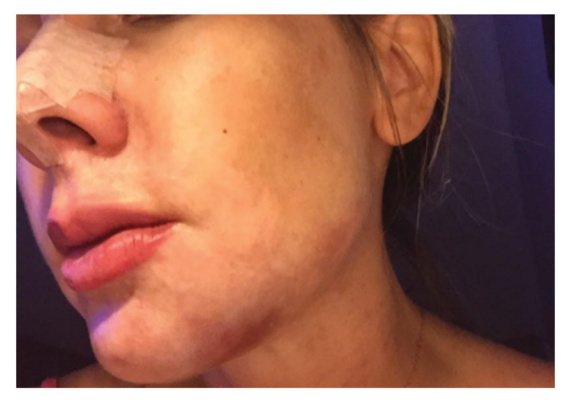
Figure 6. 9 January 2019. Immediate post-procedure. Hematoma and skin with cyanotic/hyperemic aspect.