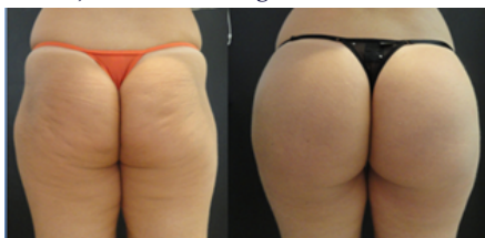
Figure 3 - Images before and after treatment using subcision (GoldIncision®) and PMMA filling.