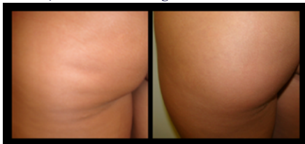
Figure 2 - Images before and after treatment using subcision (GoldIncision®) and PMMA filling.