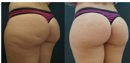
Figure 4 - Images before and after treatment using subcision (GoldIncision®) and PMMA filling.